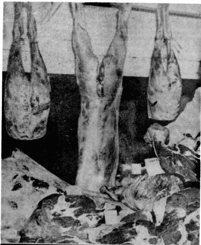
Dressed to kill: The appetizing look of dressed and processed meat often hides the presence of harmful chemicals.

But the real indictment of the government agency comes in this shocker from the learned doctor who has conducted many experiments in cancer. He lashed out: