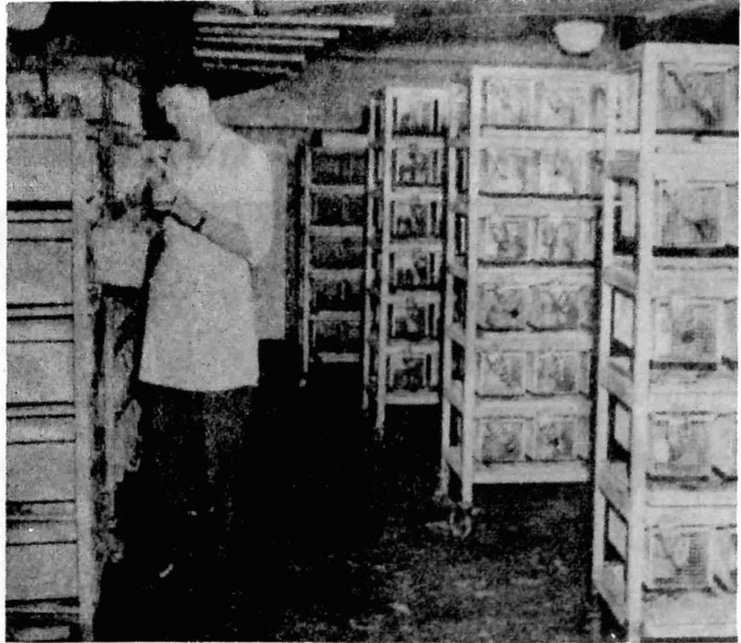
Cancer-producing chemicals are tested on animals and experiments often expose dangerous chemicals used in food.

fore it, and knowing full well that many of the foods mentioned in the report were being eaten daily by millions of Americans, did the Food and Drug office act? Certainly it did. With a speed ignited by the protests of the powerful chemical trusts and leaders in the food industry, the food and drug agency said—PUT THE LID ON IT. Suppress the report. Don't tell the American people about the poisons they're eating.