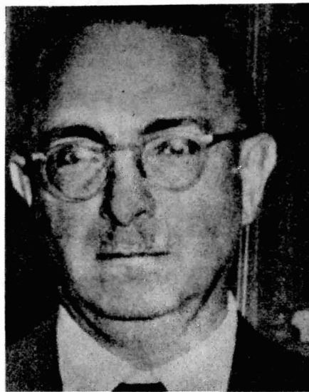
Dr. W. C. Hueper, top cancer expert of U.S. Government, whose sensational report exposed harmful food additives.

Potential cancer hazards are the triphenylmethane dyes, light green SF and fast green used to color candies, essences, cordials, biscuits, cakes, jellies, maraschino cherries and frozen deserts . Brilliant blue is also a cancer hazard. This is used